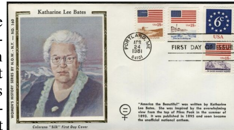
USA 1981 Scott #1890, #1891, #1893

Frances Willard (1839-1898) taught at colleges that would later become parts of Syracuse University and Northwestern University. She participated in the founding of the Women’s Christian Temperance Union, eventually becoming president. Frances met social reformer and songwriter Anna Adams Gordon in 1877. They lived together romantically until Anna’s death. In 1888, Frances became the president of the National Council of Women of the United States.