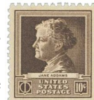
USA 1940 Scott #878