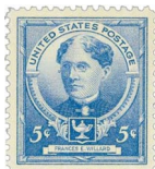
USA 1940 Scott #872

What Is It? The term “Boston marriage” refers to a non-traditional, domestic relationship between two middle- or upper-class women. Many, but not all, were romantic. These queer, committed partnerships occurred primarily in New England, where higher numbers of college-educated women were financially secure enough to choose whether to enter into a conventional marriage with a man.