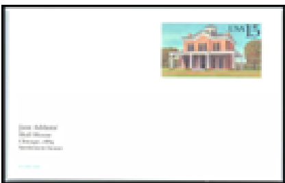
USA 1989 Scott #UX134