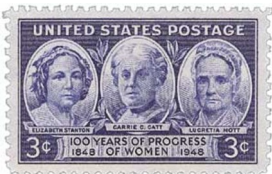
USA 1948 Scott #959